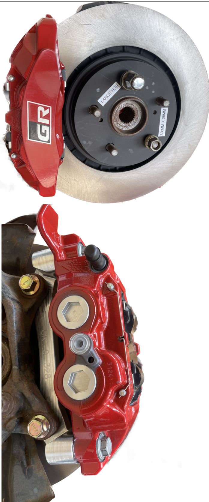
2019 Lexus RX350 rotor is used in image above

Install the rotor to the correct side of the car and use lug nuts to hold it onto the hub. Mount the caliper onto the knuckle and slide the 17mm bolts through the brake caliper mounting ear and into the adapter's thread. Take care to ensure that the caliper is square and evenly started on both bolts. Check for rotor clearance and make sure it's well center on the caliper.